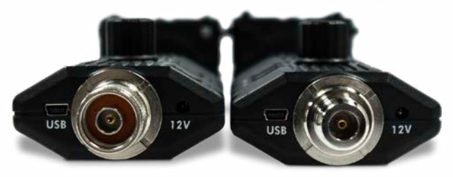
RF Connectors N Male and N Female