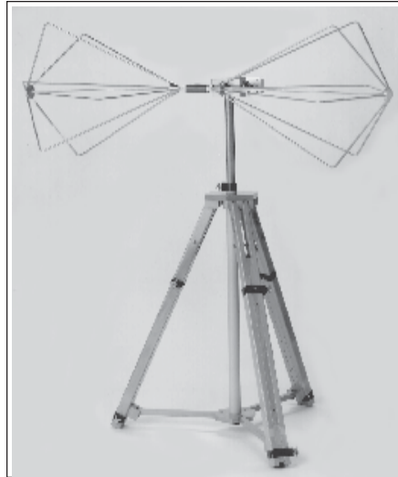
Figure 1.1 Biconical Antenna (w/ tripod AT-100)