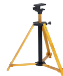
AT-812 Antenna Tripod