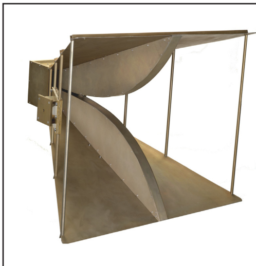
Figure 1-1 AH-220 Horn Antenna