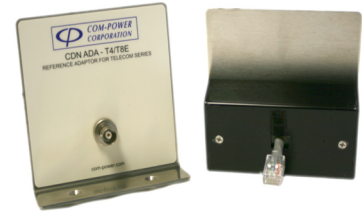
Shorting Adapter Set ADA-T4/T8