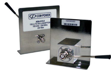
ADA-515-2 Adapter Set