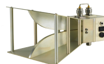
AHA-118 Active Horn Antenna (1-18 GHz)