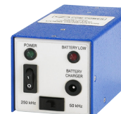
CGC-255E Conducted Comb Generator