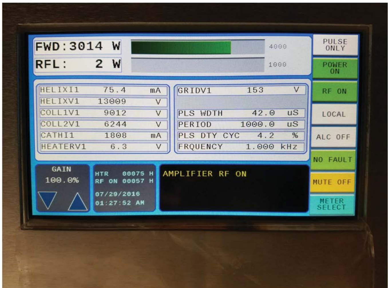
Figure 1. Typical Pulse Amplifier display showing status controls and metering

Reliant EMC LLC P.O. Box 32543 San Jose, CA 95152 408 916-5750 Contact@ReliantEMC.com www.ReliantEMC.com