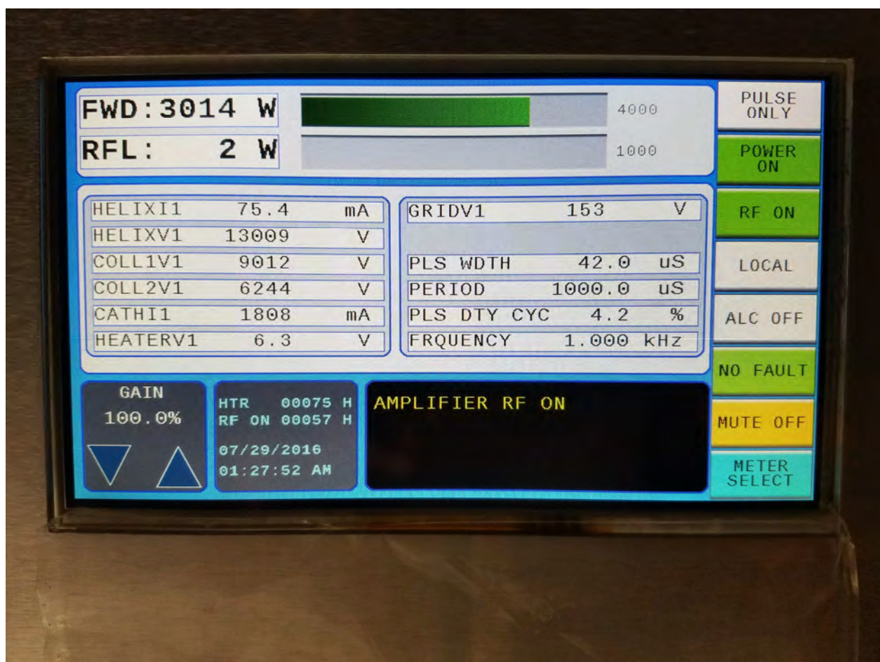
Figure 1. Amplifier display showing status controls and metering