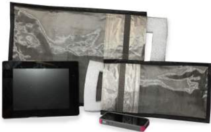
Part# SFP610 and SFP1113