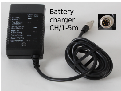
Battery charger CH/1-5m

100-240V input 4-10 cells charge output to charge integrated batteries of BPxxx-5f and optical devices NOT allowed during use (DOES NOT power constantly!)